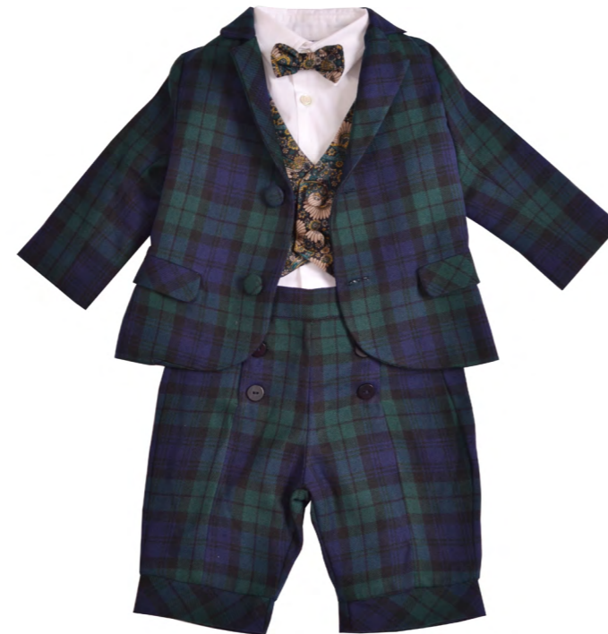
21038(bermuda) 21039(jacket) 21070 (gilet) 21041 (shirt)