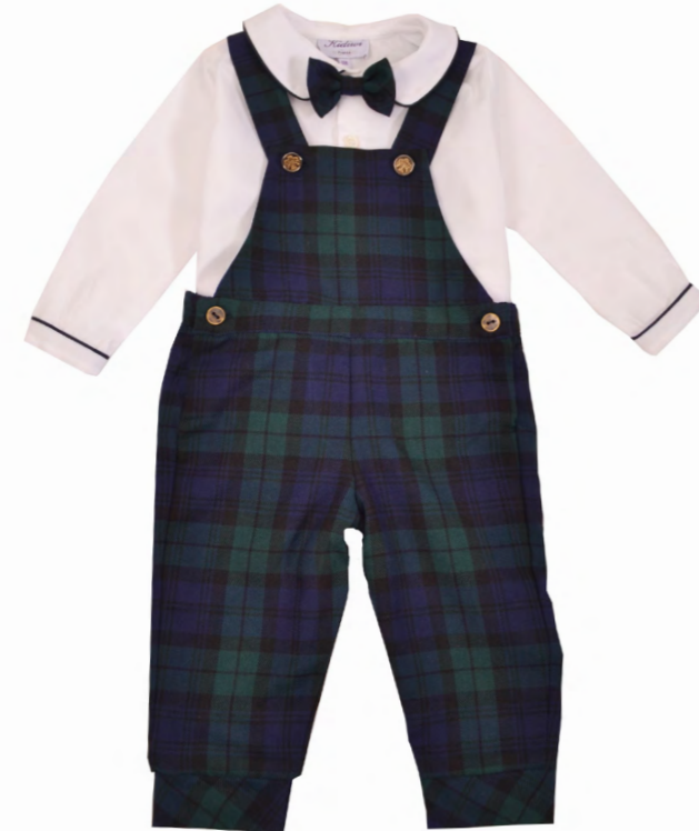
21071 (shirt) 21037 (dungarees)