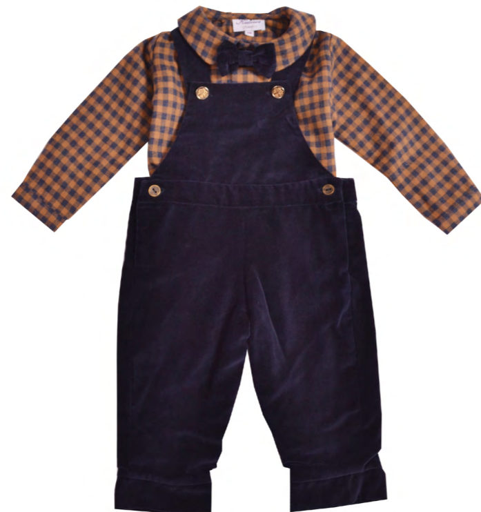
21074 (shirt) 21066 (dungarees) Bowtie (navy)