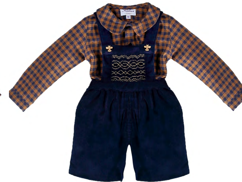
21074 (shirt) 21075 (dungarees)