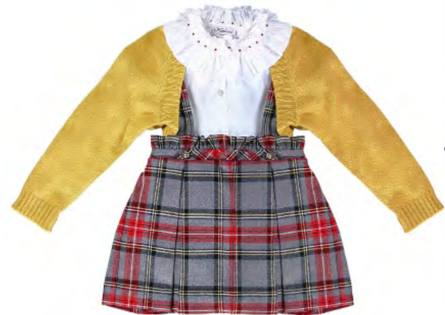
21096 (blouse) 21050 (skirt)