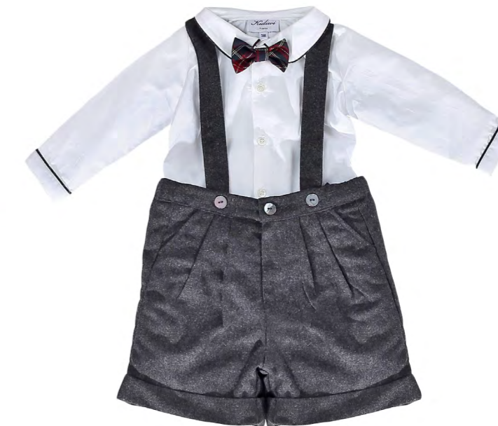
21071 (shirt) 21080 (short) Bowtie (TT212)