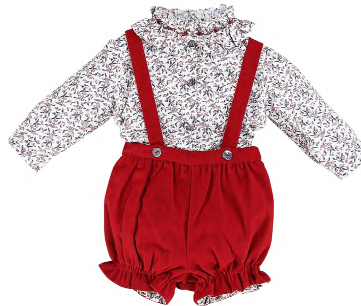
21017 (blouse) 21016 (bloomer)