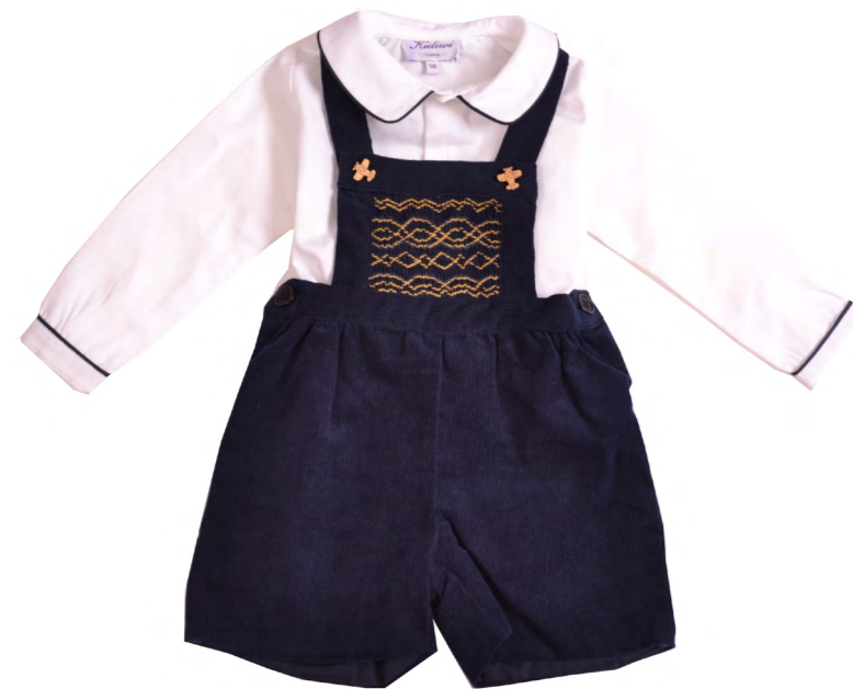
21071 (shirt) 21075 (dungarees)