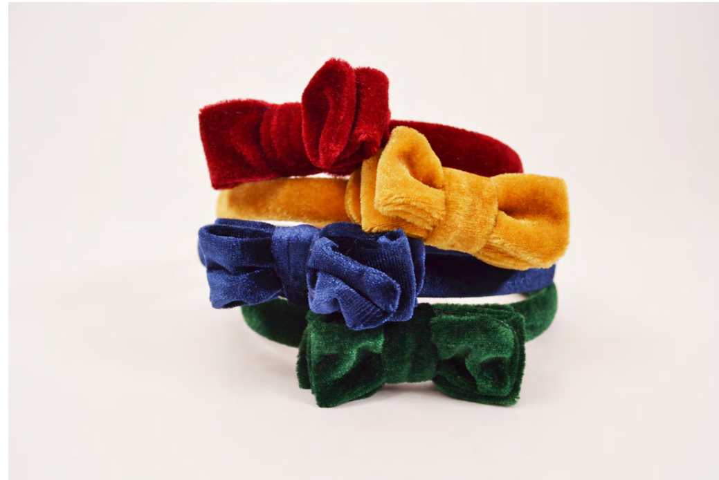
Headbands in velvet : TV215 (red) TV217 (mustard) TV219 (navy) TV214 (green)

* create yours! you can pick whatever fabric from our collection