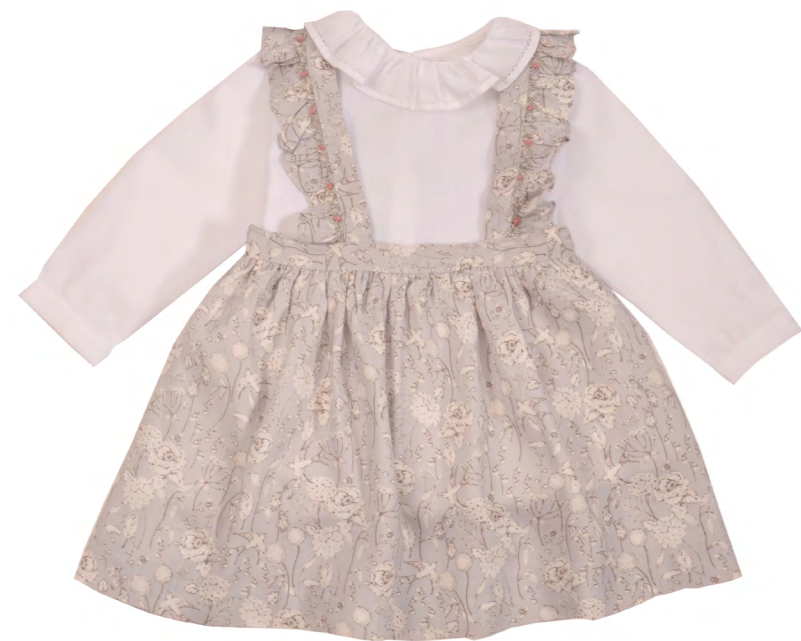
21093 (blouse) 21002 (skirt)