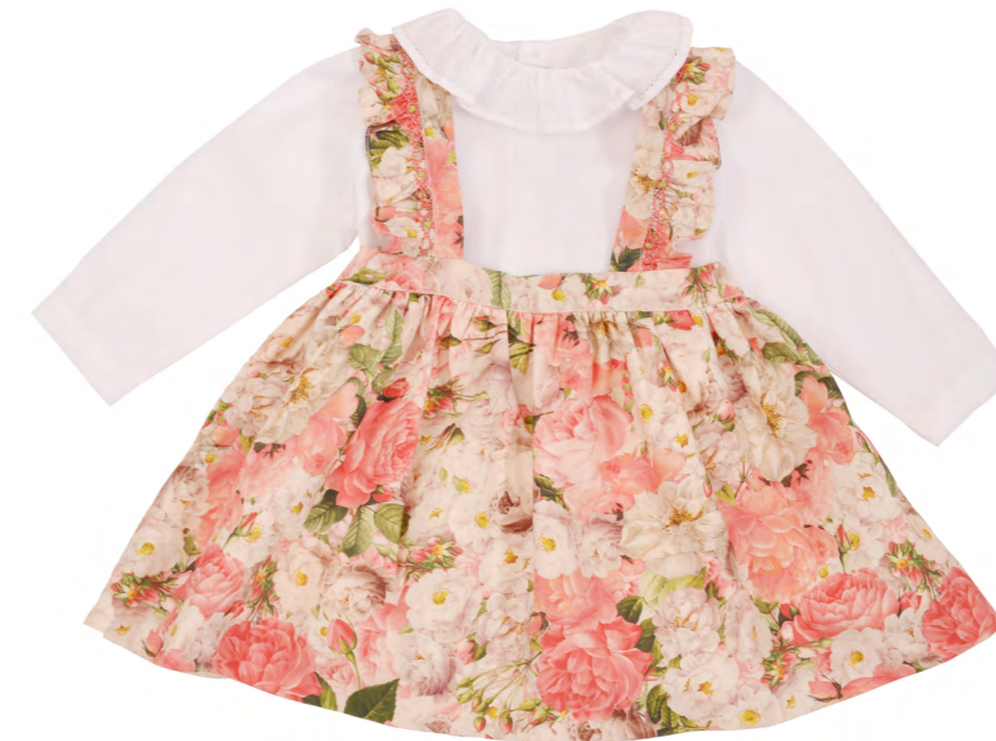
21093 (blouse) 21026 (skirt)