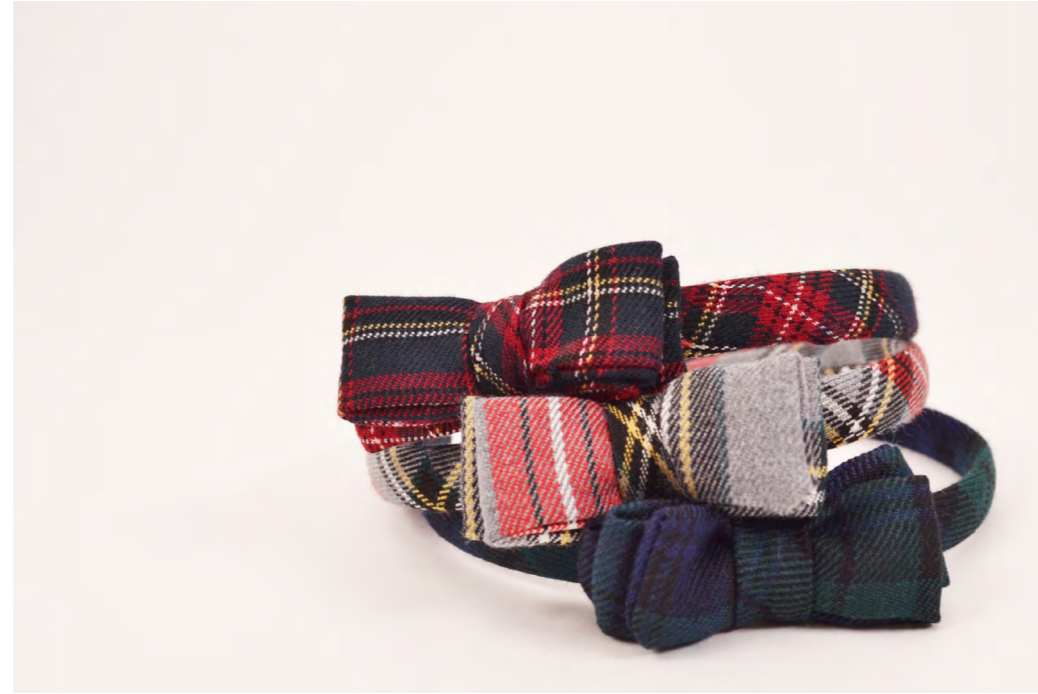
Headbands in Tartan : TT212 (navy/red tartan) TT211 (grey tartan) TT210 (blackwatch)

* create yours! you can pick whatever fabric from our collection