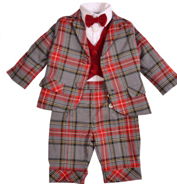
21052(bermuda) 21053(jacket) 21046(gilet) 21041 (shirt)